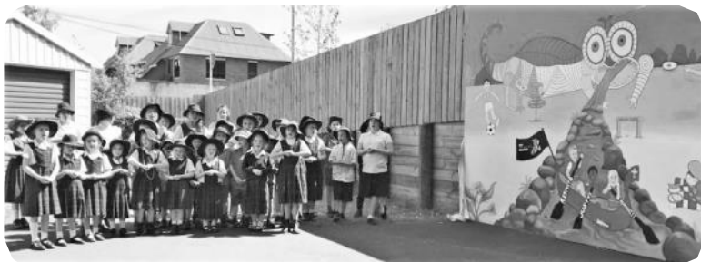
Sacred Heart School pupils celebrate their new mural.

The mural came about after entering a Keep New Zealand Beautiful competition in which their design won the national competition. Some fantastic guidance and advice from Resene helped to get the wall prepped and primed. As the chosen wall is in a shady spot, contending with the cold, wet months was possibly the greatest challenge of all.