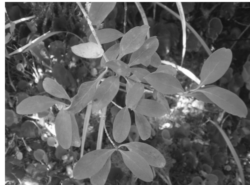
Coprosma foetidissima.

We are incredibly grateful and delighted to have received funding and support through Predator Free Dunedin's City Sanctuary Project, Te Ao Tūroa, Dunedin's Environment Strategy: and the ECO Fund to support the continuation of the Open Valley Urban Ecosanctuary and Backyard Ecosanctuaries project. We are also grateful for the continued support of our collaborators, The Valley Project, Orokonui Ecosanctuary and the University of Otago.