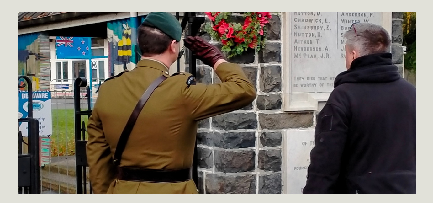
School War Memorial Re-Dedication