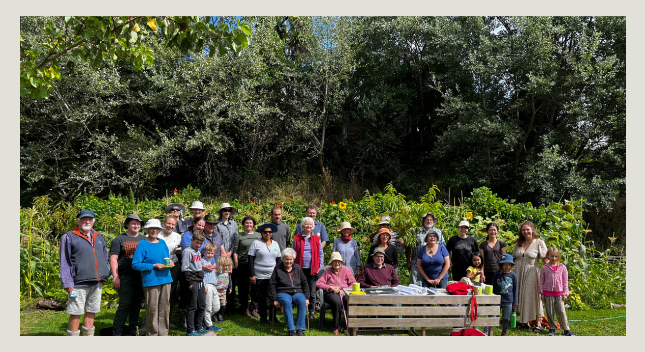
Our Community Gardeners