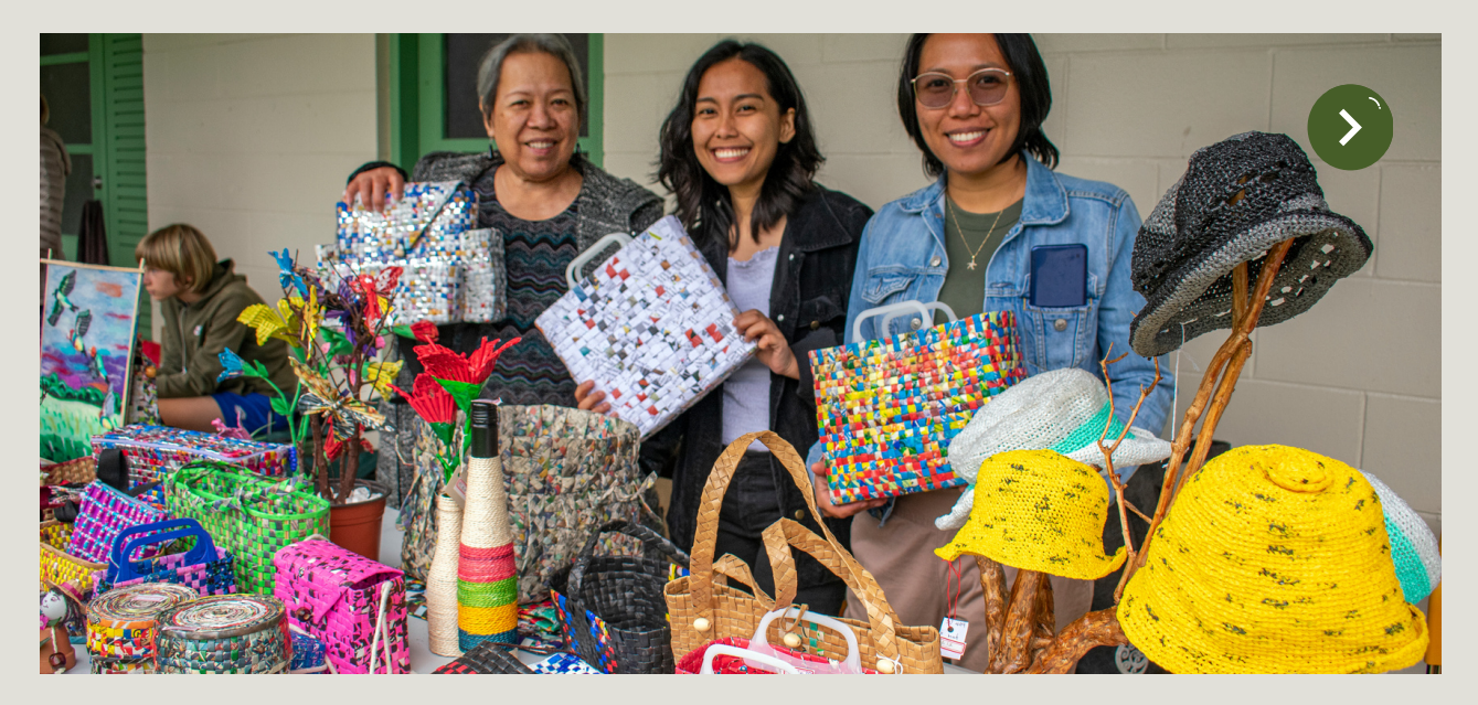
Trash To Treasure from Pine Hill at Creek fest