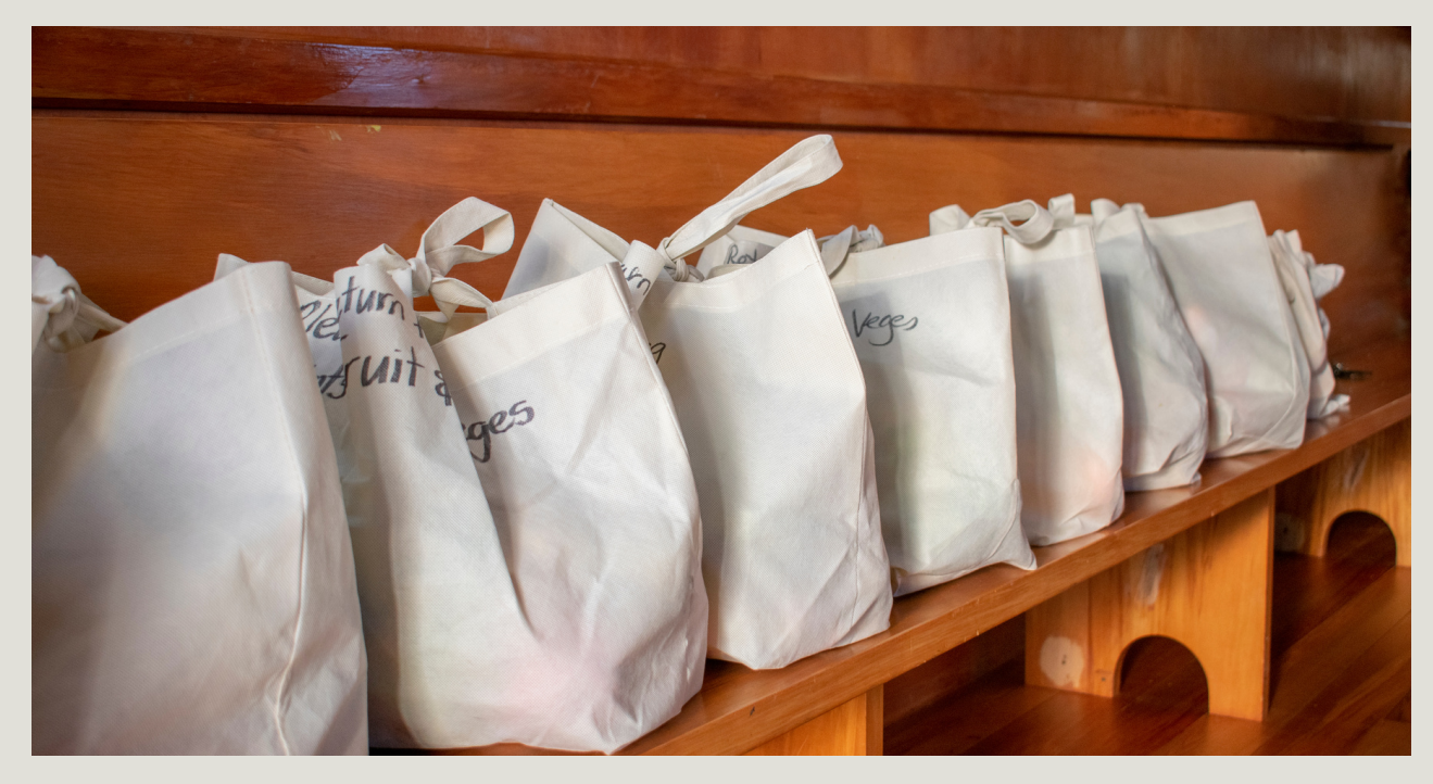
Community Kai Parcels