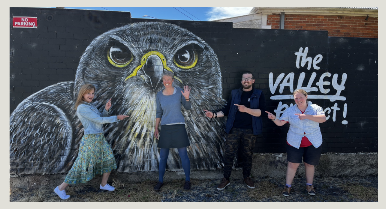
Our cool team.... some of them!

The many community projects we support are mostly going strong too: