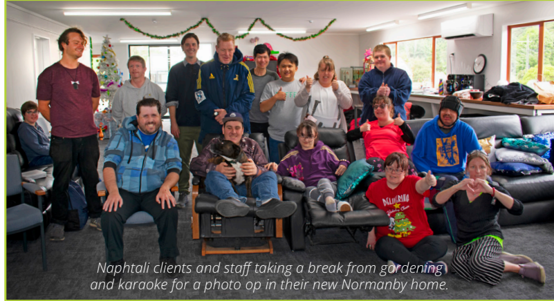
Naphtali clients and staff taking a break from gardening and karaoke for a photo op in their new Normanby home.

For those of you unfamiliar, Naphtali is a fun place with a full programme providing for people with disabilities. At Naphtali people can enjoy being at the centre and socialising with others while baking, exercising in our gym, (Continued on page #5...)