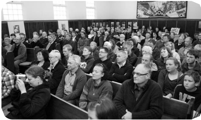
Part of the crowd at the Opoho Church Dunedin North candidates meeting in 2011. The popular forums have been running for at least the past nine elections.

All welcome by 7pm (all over by 9.10pm, apart from a post-match mingling opportunity) at the church on the corner of Signal Hill Rd and Farquharson St.