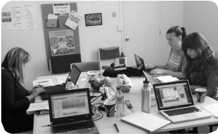
Mums in business, or studying, crank out a valuable two or three hours work at a shared space while their children are cared for in the next-door room at the Valley Project community rooms.

The next pop-up space at the Valley Project will be held on Monday 18 September from 10.30am to 3.30pm. Bookings can be made via the Share Your Gold website http://shareyourgold.com/project/shareyourspace/