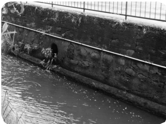
An innocuous-looking stormwater drain delivers another batch of North East Valley soup into Lindsay Creek.

If you think that sounds a bit nasty, what goes down the drain when it isn't raining can be just as bad. Many people don't realise that whatever goes down the outside drains on your property and on the road ends up in Lindsay Creek untreated. This is unlike what goes down your inside drains like your loo, shower and washing machine, which is