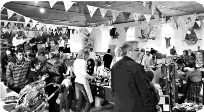
The annual Northern Artery Arts Bazaar has a special buzz all of its own

The Northern Artery collective originally conceived the idea as a means