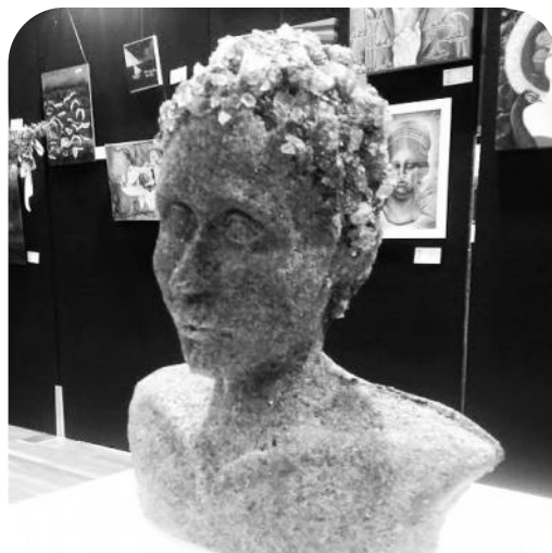
The sculpture which is currently on show in the Art Tardis outside the Grid Coffee Roastery