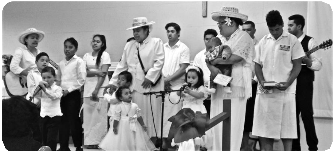
Members of the PIPC congregation presenting a song on White Sunday.

WHITE SUNDAY, when Pacifica families give thanks for their children, was celebrated at the Pacific Islanders Presbyterian Church on North Rd last month.