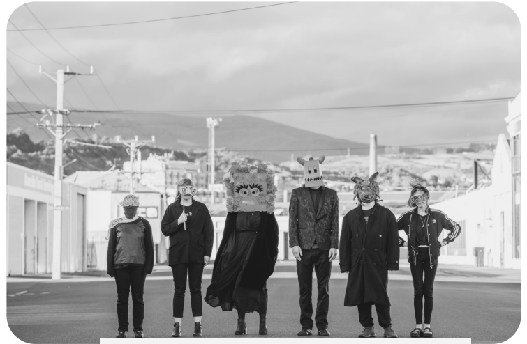
Six core artists from Spectacle.