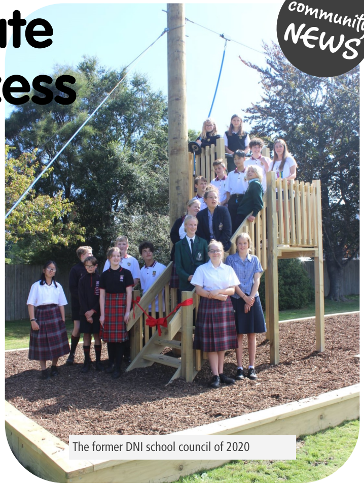
The former DNI school council of 2020

Many of the students from the council have since moved on to high school, but the entire 2020 student council was present at the opening to cut the ribbon for all of their mahi. Anticipation was high as the gates came down earlier than