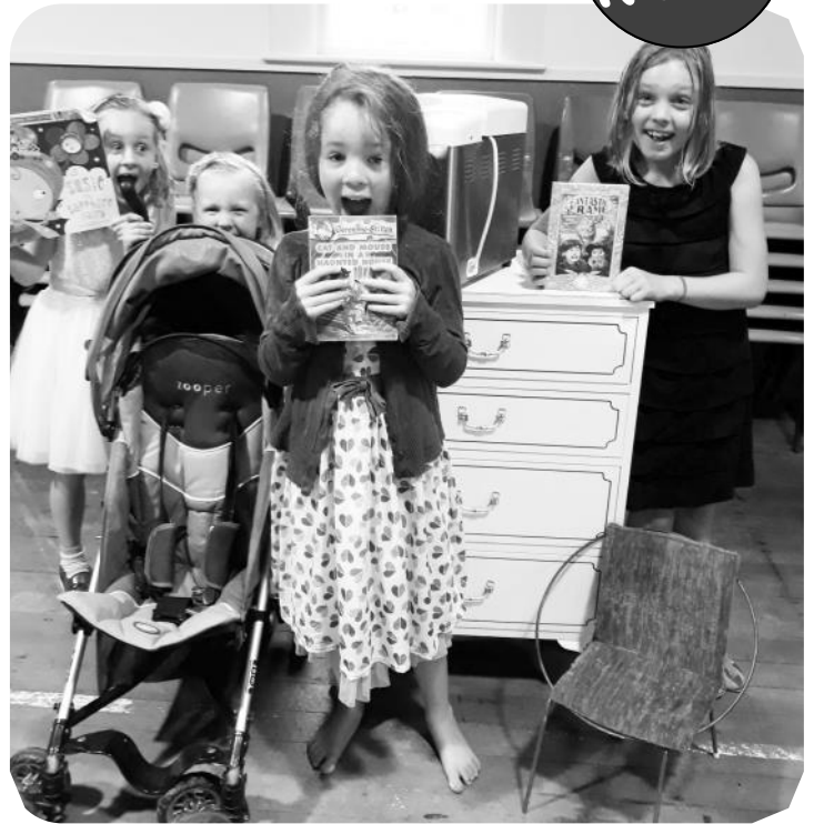
Sacred Heart School pupils get their eyes on some treasures ahead of the Monster Garage Sale coming up Saturday 9 February.

Head to Sacred Heart School at 63 North Rd on Saturday 9 February from 10.30am-1.30pm to find yourself some treasures.