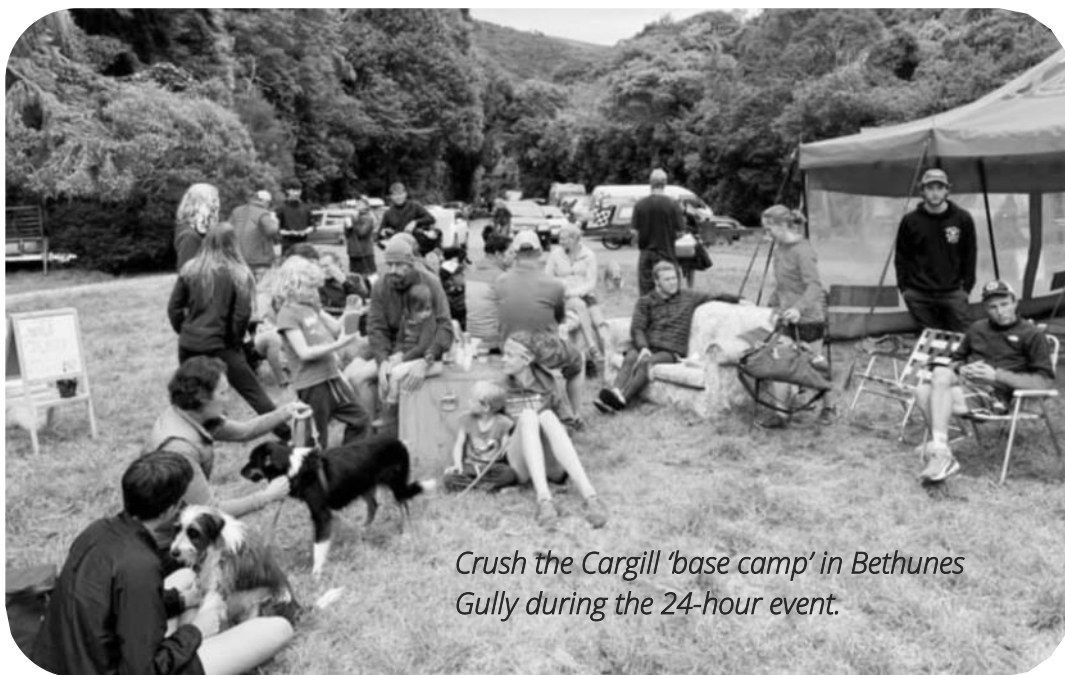
Crush the Cargill 'base camp' in Bethunes Gully during the 24-hour event.

Event organisers are so amped with the success of the day they are already planning this year's event, and will introduce a new event called the Longest Shortest Day. Scheduled for an 8pm start on Friday 21 June, entrants will run up and down Mt Cargill every two hours until either only one person is left standing, or it is Monday and time to go to work! More details on the Facebook event page.