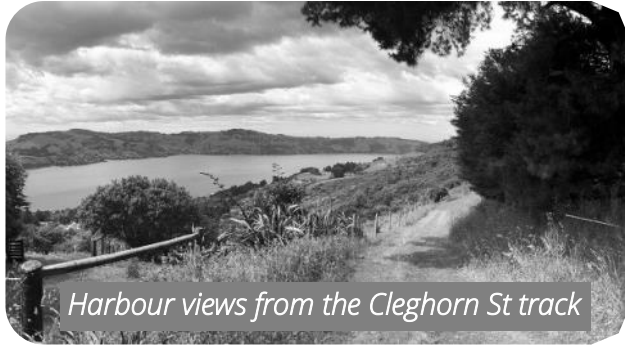
Harbour views from the Cleghorn St track

A GOOD climb and spectacular harbour views await on this 9km loop from the valley to Cleghorn Street Track and Signal Hill.