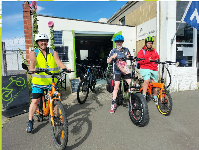
Dunedin Electric Bikes