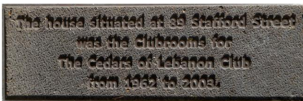
Street Plaque - Stafford St