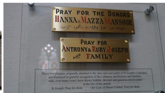
Plaque - St Joseph's Cathedral