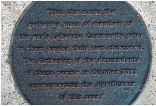
Street Plaque - Cnr Carrol St & Hope St (Bell Tea cnr)