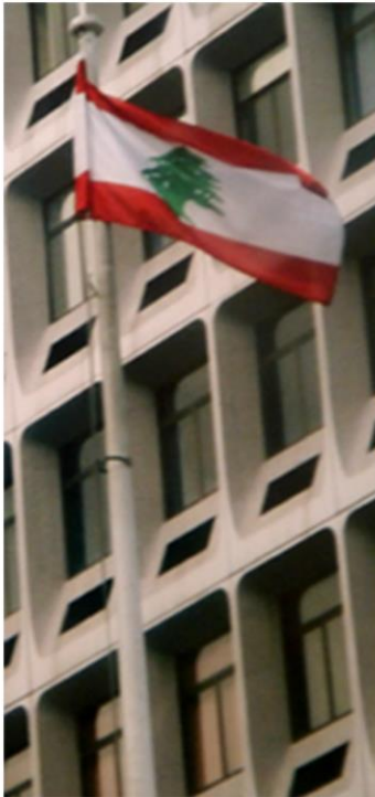
Annual occurrence - Lebanese Flag flying from Civic Centre balcony to Celebrate Lebanon Independence day