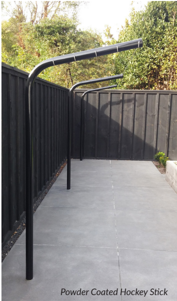
Powder Coated Hockey Stick